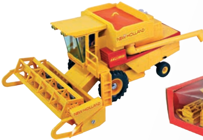
New Holland TR85 combine. Models sold in North America were supplied in a plain red box.