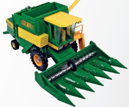
The Corn King 4891 produced in 1984.

Based on the New Holland TR85 casting, the model had a slightly different grain tank incorporating engine details and access steps instead of the rotary cleaner. A new maize header and straw chopper were also