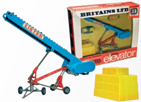
Electrically- powered Lister elevator, code 9565, released in 1965. The battery was hidden in the bale stack.

The first baler, a Bamfords BL58 released in 1967, was a realistic-looking working model – perhaps the best farm