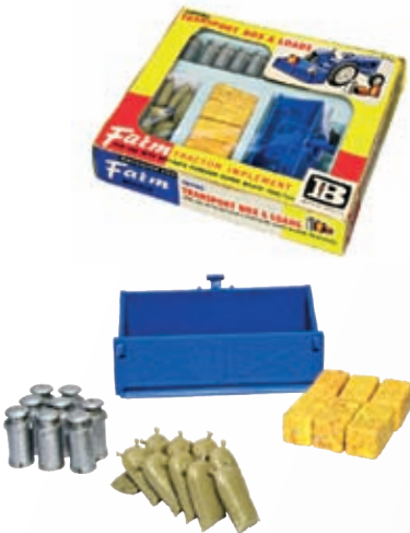
Transport box and loads released in 1964.