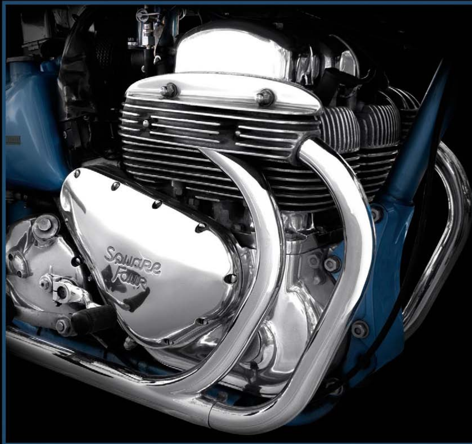
(Motorcycle courtesy Jeff Dancey)