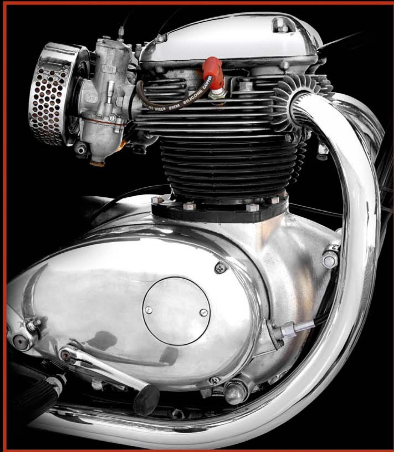
(Motorcycle courtesy Clay Walley)