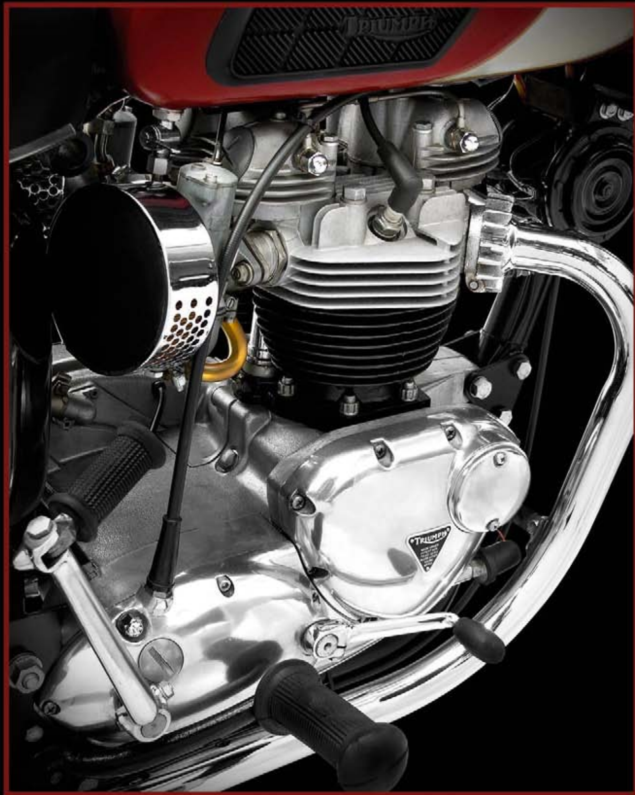
(Motorcycle courtesy George Tuttle)