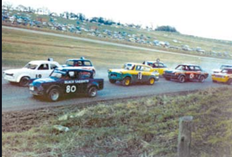
A domestic line-up of PRI Hot Rods at Lydden circuit in Kent.