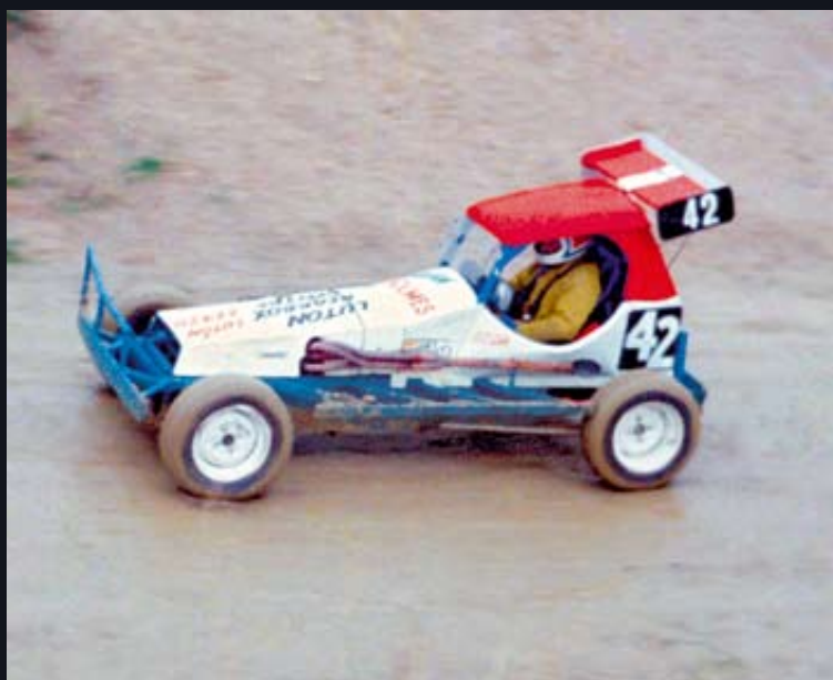
One of the top men in PRI Formula Three, Brian Holmes, at Arena Essex.