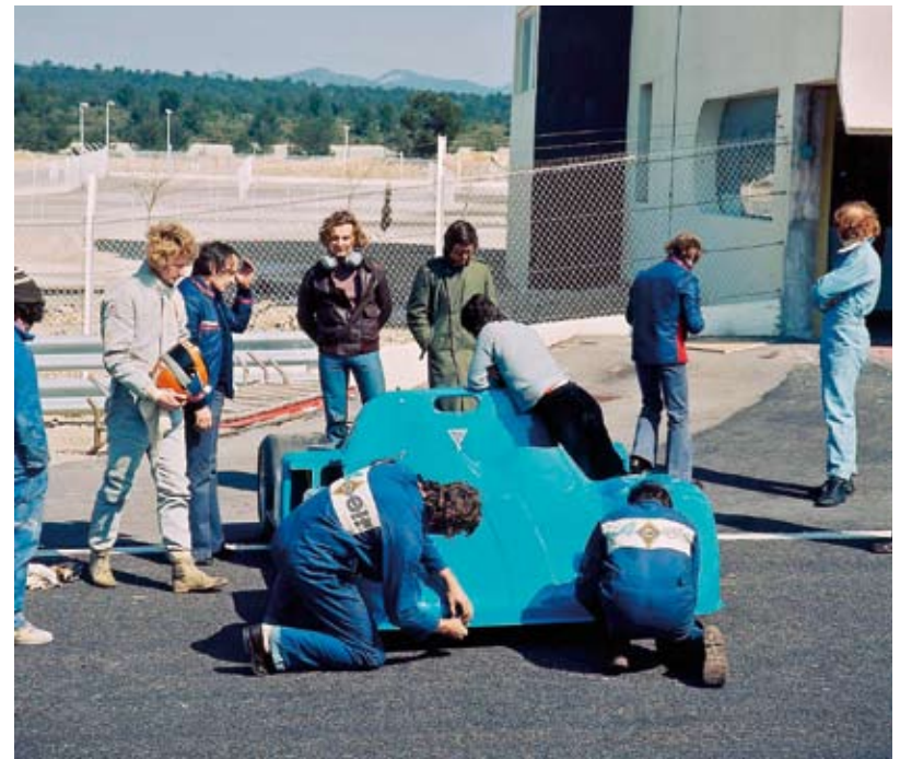
Final adjustments: Jabouille waits, helmet in hand.