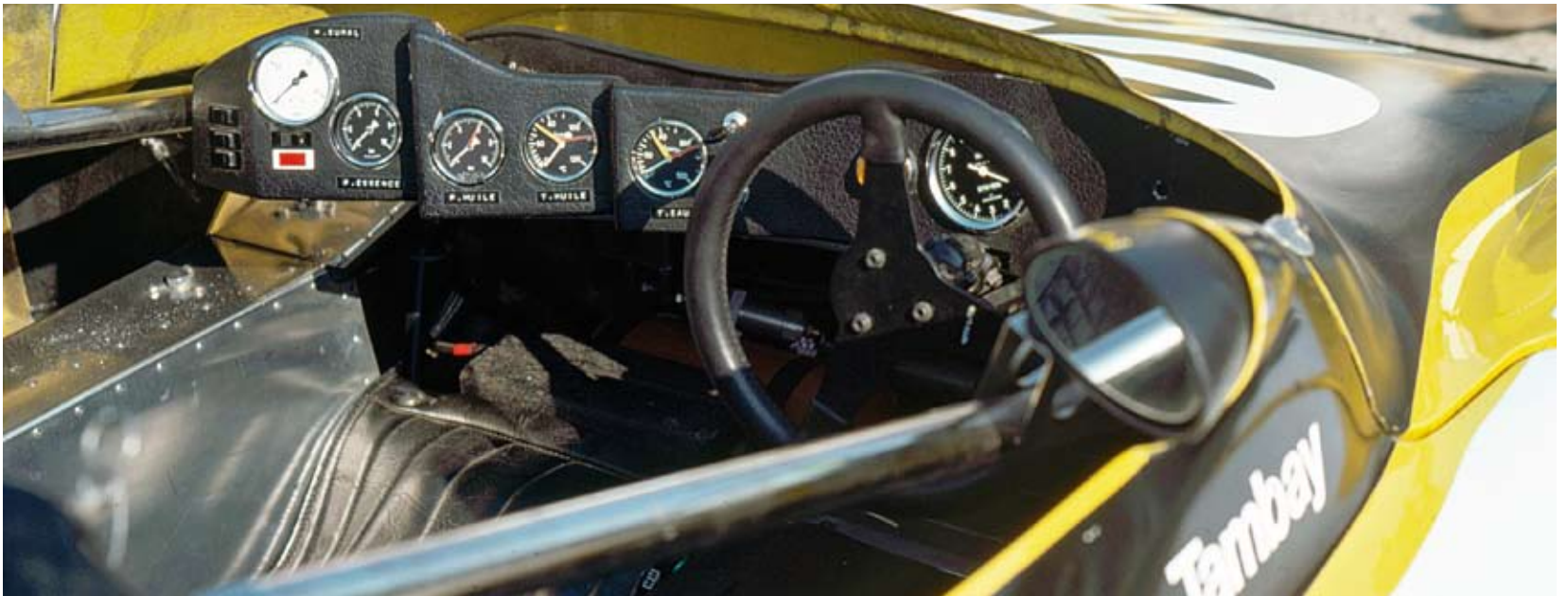
The office.