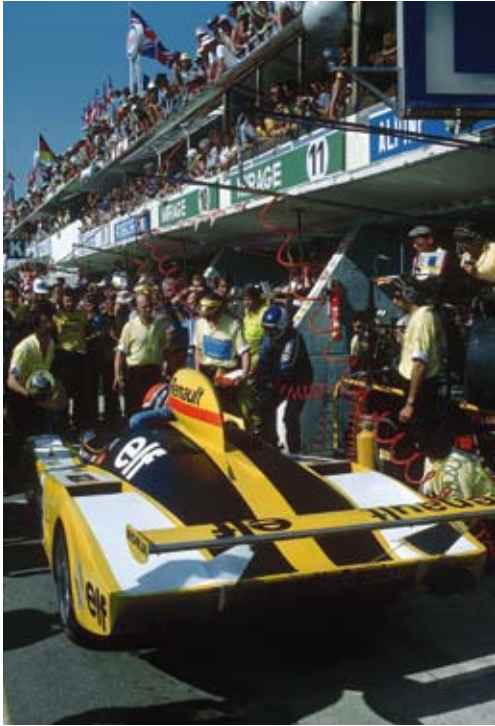
Jabouille: superfast practice. (©R)