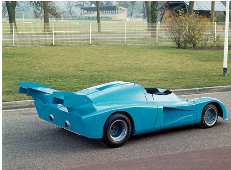
First sight of the A440-0 in the open, outside the plant, March 1973.

Six months later the new car, named the A440, rolled out of the workshops in Dieppe. It was a Barquette conforming to European Championship regulations.