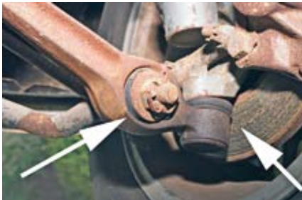
The anti-roll bar bushes and the bottom ball joints are prime candidates for wear.