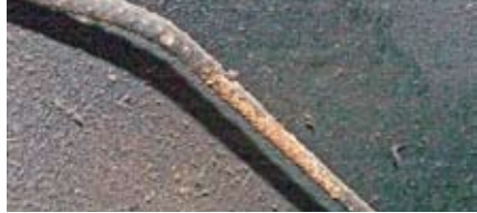
Check brake pipes for corrosion.

Front discs should be checked for scoring, wear and rust. They're also prone to warping which will show up during the test drive. Calipers seize thanks to internal corrosion from unchanged brake fluid and from damaged dust seals; replacement is straightforward and they're fairly cheap. Check solid brake lines for rust throughout the car, although the ones at the back are the most vulnerable. Flexible hoses should be examined for splitting or other signs of deterioration, or even contact with other components. Brake back plates should show no sign of leaks from either the top, around the cylinder mounts, or at the bottom, which would indicate fluid leaking internally.