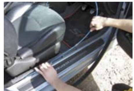
Thread the pipe under the carpet, then replace the trim.

If you have chosen a WON system, you'll most likely have been supplied with the high pressure 5mm nylon pipe to connect the nitrous cylinder to the nitrous solenoid. It is essential that this pipe be routed as shown in the accompanying picture. The pipe must be routed away from any heat sources and take a cool route through the inside of the car with the wiring loom. It should then run either into the scuttle (between