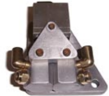
To make my first valves more flexible I added a pneumatic ram so customers had the option of cable-operation or push button pneumatic operation (mainly used on bikes).