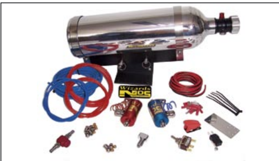
The most popular wet system in the UK, the WON Street-Blaster 100i single injector system.

the most basic nitrous oxide systems function. If you have any doubts about how a basic system works, please take the time to read this section. It's important to understand and have a full command of the basics of nitrous