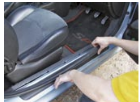
Remove the carpet securing trim.