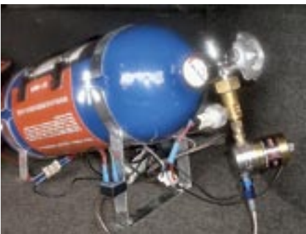
Electric bottle control solenoid from Cold Fusion.

WON currently offers a manually-operated, in-line QA valve, which is positioned beside the driver's seat. The bottle valve can be left permanently open