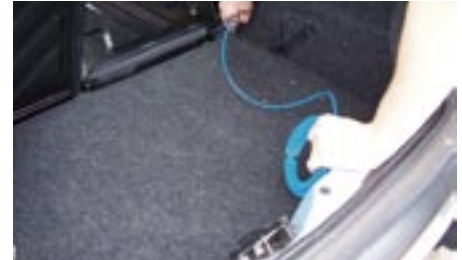
The pipe has to be carefully routed from the nitrous cylinder to the nitrous solenoid.