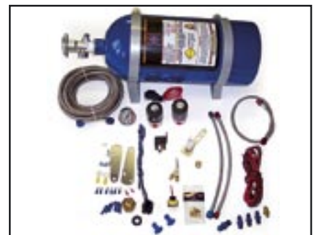
A typical budget wet kit with generic solenoids from Cold Fusion.

injection, before learning the higher end of the subject. If you want to get the best from your nitrous system and your vehicle, you need to be sure your work is based on a good foundation.