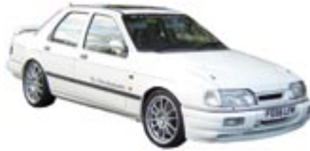
The fastest (regularly used) nitrous-assisted street car in Europe, with a top speed in excess of 210mph.

Without nitrous 0-60 4.3 seconds 0-100 8.1 seconds 0-150 16.0 seconds Top speed 200mph