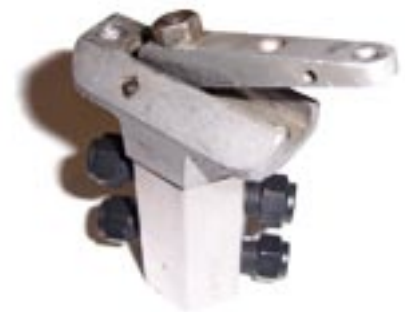
The first combined fuel and nitrous valve I manufactured, with the valves stacked on top of each other. This basic design was offered in 3 different operating formats.

manually activated fuel and nitrous valves, which were joined and operated by a common lever. Although these worked very well, I soon realised that a