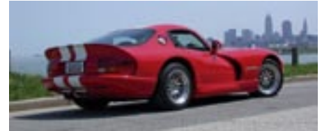
An outstanding example of the Viper, a high-performance American muscle car.

"I've used most types of nitrous kits over the years but none have been anything like the WON system in any way. The