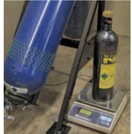
Weighing the bottle before and after a nitrous fill is essential.

Large (donor) cylinders from gas companies are supplied either with a siphon tube so the bottle remains upright