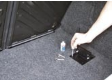
A sequence of shots showing how to first position the nitrous cylinder and bracket in the boot to mark the position of the securing screws ...