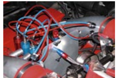
This is a unique 2 stage WON system fitted to Viper V10 (one injector per bank per stage).

components are unique and the power delivery is deceptively smooth and makes more torque than I ever imagined possible. I'm confident that next season my car will run deep in to the 9 second bracket for the quarter mile."