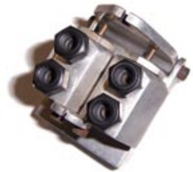
General view of the combined valves that were originally cable-operated.

By the end of 1982 I had perfected my first valve design and it was in regular use, producing reliable and outstanding performances. There was so much interest shown in my system, that I began to manufacture systems for customers. These first valves were